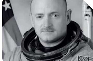
Captain Mark Kelly Astronaut and U.S. Navy Captain

Friday, November 4, 10:15 a.m. Closing General Session